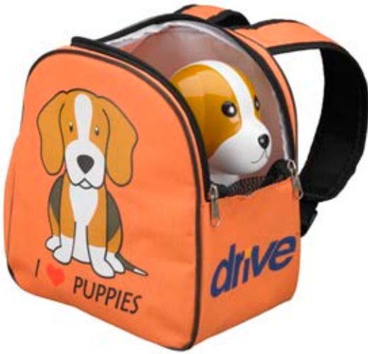
Comes with Doggie House Carry Bag